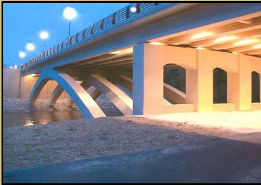
Siebenthaler Bridge, Montgomery County