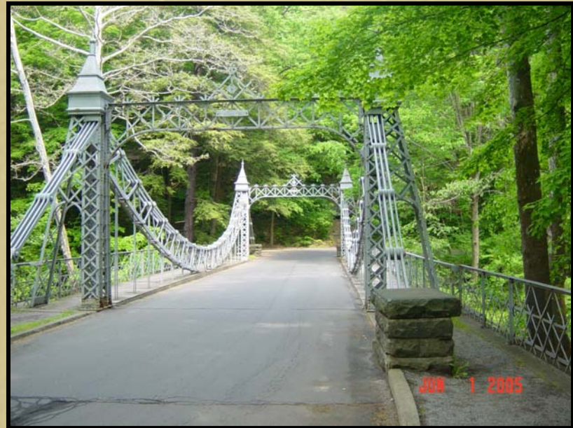
Silver Bridge, Mahoning County